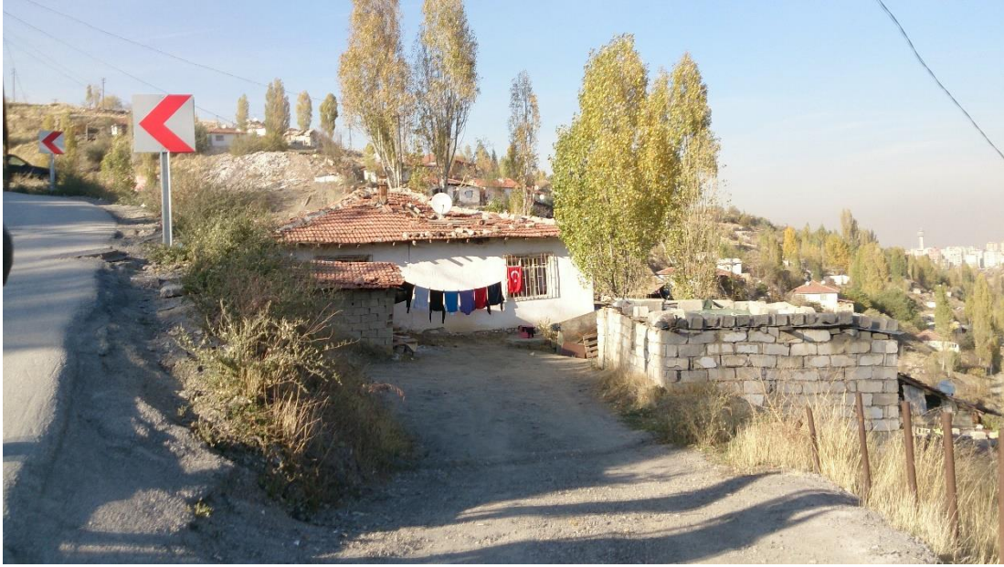
Photo: Gecekondus in Dikmen Valley before the project in 2015